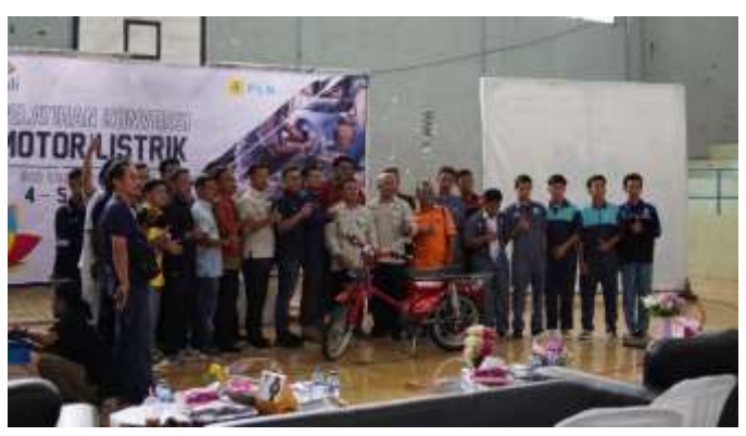
Figure 4. Closing with a group photo session