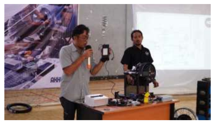
Figure 1. Exposure to electric motorbikes to participants

Conclusion Its implementation takes the form of a farewell session between the service team and participants held at the Balai Warga Jl. Betet Raya, Cibodasari Village, Cibodas District/Village, Tangerang City, Banten, Indonesia.