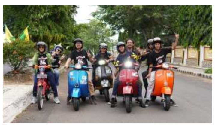
Figure 3. Experiment using an electric motorbike