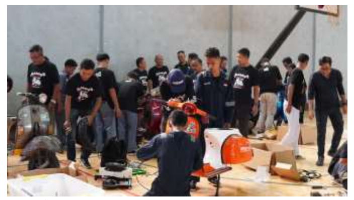
Figure 2. Electric motor conversion practice